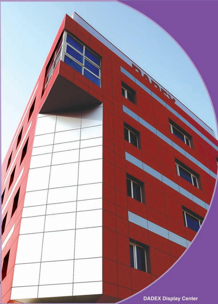
DADEX Display Center